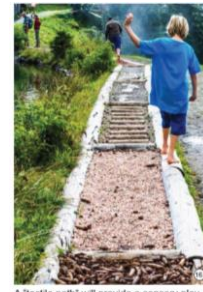
A 'tactile path' will provide a sensory play experience