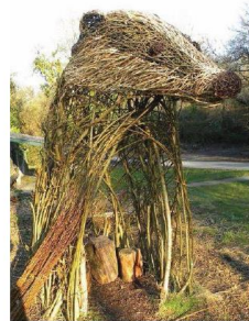
Public artwork using natural materials.